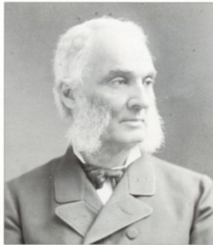
Black abolitionist Robert Purvis, author of the Appeal of Forty Thousand . Gratz Collection. Title page (TOP) of Robert Purvis, Appeal of Forty Thousand Citizens, Threatened with Disfranchisement, to the People of Pennsylvania (Philadelphia, 1838).

upon the mercy of a despotic majority. Like every other despot, this despot majority, will believe in the mildness of its own sway, but who will the more willingly submit to it for that?